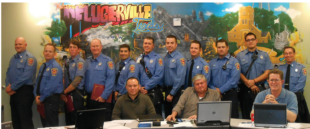
The Phoenix Award recognizes first responders who resuscitated cardiac arrest patients. TCESD No. 2 recipients were honored with 2012 Phoenix Award during the February 2013 Board of Commissioners meeting.