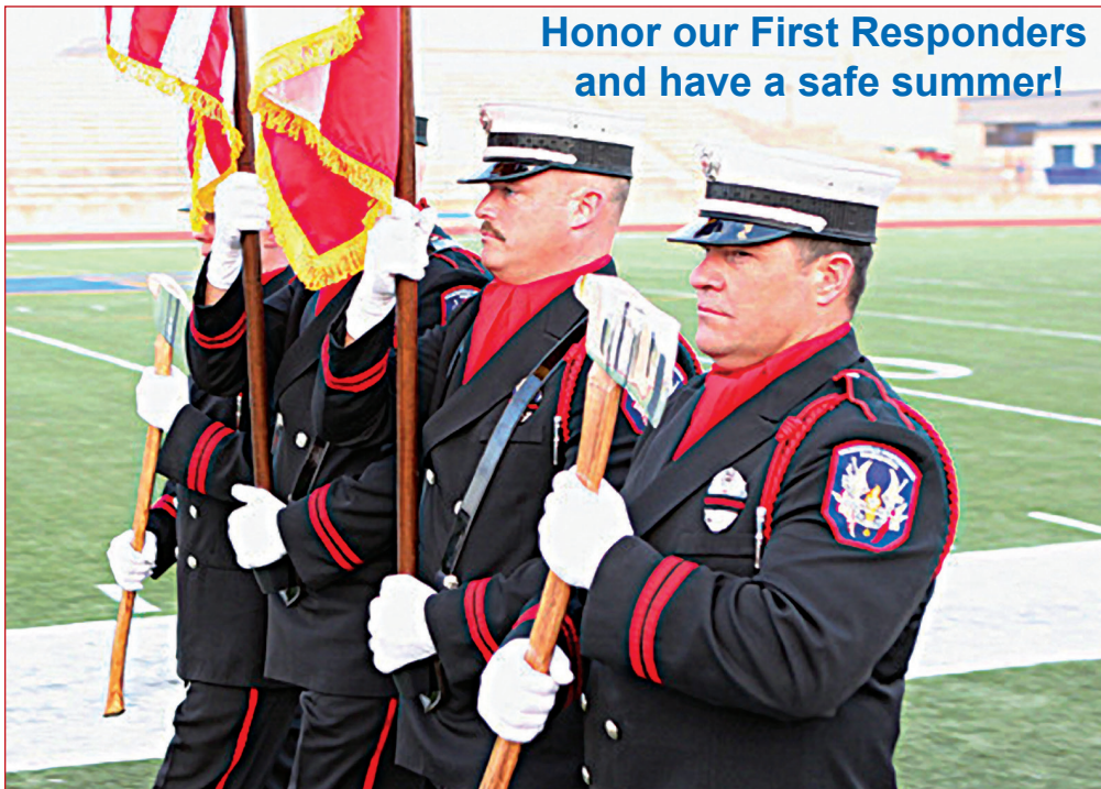
Honor our First Responders and have a safe summer!